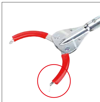
Opened tips for scraping off stuck-on residues