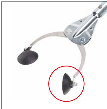
Special grabber with cups for picking up tiny, smooth and wet parts