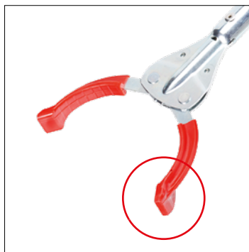
Anti-slip plastic-coated grabbers for indoor and outdoor use