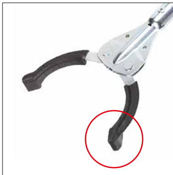
Anti-slip plastic-coated grabbers for indoor and outdoor use